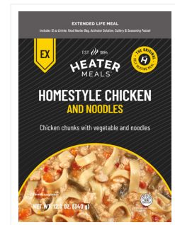
Homestyle Chicken & Noodles