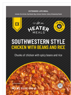
Southwestern Style Chicken with Beans & Rice