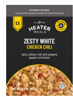
Zesty White Chicken Chili