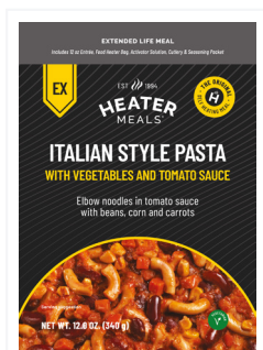
Italian Style Pasta with Vegetables & Tomato Sauce