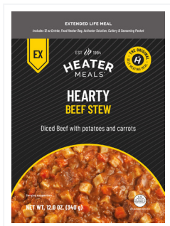
Hearty Beef Stew

18 meals per case; 3 each of the following meals